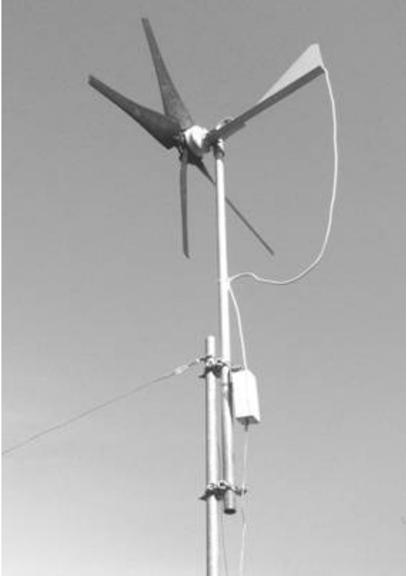
Barrie's Wind Turbine

On retiring in 1995 I had hoped to bring back to life a small local hydropower plant, but it was not to be, and so I decided to support others, both technically and financially. I now have a small share in 37MW of renewable wind and hydro plant and on a domestic scale have built a 1.8m diameter wind turbine which helps keep my workshop/radio museum (a.k.a. a shed) cosy.