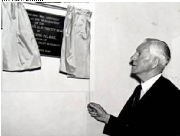
Fig.1 Lord Citrine opening Electricity House, Bristol in 1948

Although at nationalisation industry representatives had suggested to government that the new central authority should be called the British Electricity Supply Authority this advice had been ignored, with the result that in the first few years there was the inevitable confusion with the other BEA (British European Airways). The opportunity was afforded to correct this confusion under the Electricity Reorganisation (Scotland) Act 1954 when the BEA was renamed the Central Electricity Authority (CEA), which took effect from 1 st April 1955. However, the primary purpose of that Act was to transfer to the Secretary of State for Scotland all matters in relation to electricity supplies in Scotland and the establishment of an 'all-purpose board' (the South of Scotland Electricity Board) to cover those parts of Scotland not already covered by the North of Scotland Hydro-Electric Board. Thus from 1 st April 1955 England and Wales was to continue with its 12 Area Board structure, which remained unchanged right up to privatisation.