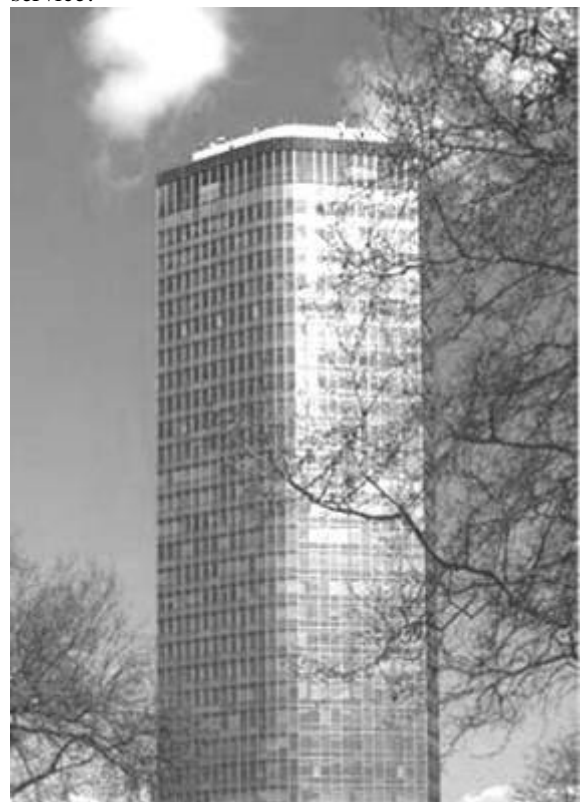
Fig.2 Millbank Tower

Salaries had proved to be a tricky issue in appointing the key people, just as they had at nationalisation. In fact the salaries of the CEA and Area Board chairmen had remained fixed since the 1947 nationalisation. Although the salary for the chairman of the new CEGB had apparently been envisaged as being less than that paid to the EC chairman, in the event both were paid the same - £10,000 per annum. Once again, the top salaries languished at these new levels determined by the government for a number of years thereafter. In fact, as former NJB staff will well remember there was often pressure being exerted on the NJB salary scales from both ends – the ever rising NJIC salaries overlapping at the bottom and the fixed salaries of government appointed senior staff preventing adequate increases at the top end. However, one compensation for the poor pay received by the EC chairmen was that if you were not already a ‘Sir’ when appointed you were awarded a knighthood following your stint of service!