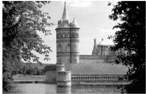
Fig.4 Horsley Towers (now a hotel)

Following ESI privatisation Horsley Towers was sold off and is currently in the ownership of the De Vere hotel group, providing upmarket accommodation, function facilities and a management conference centre.