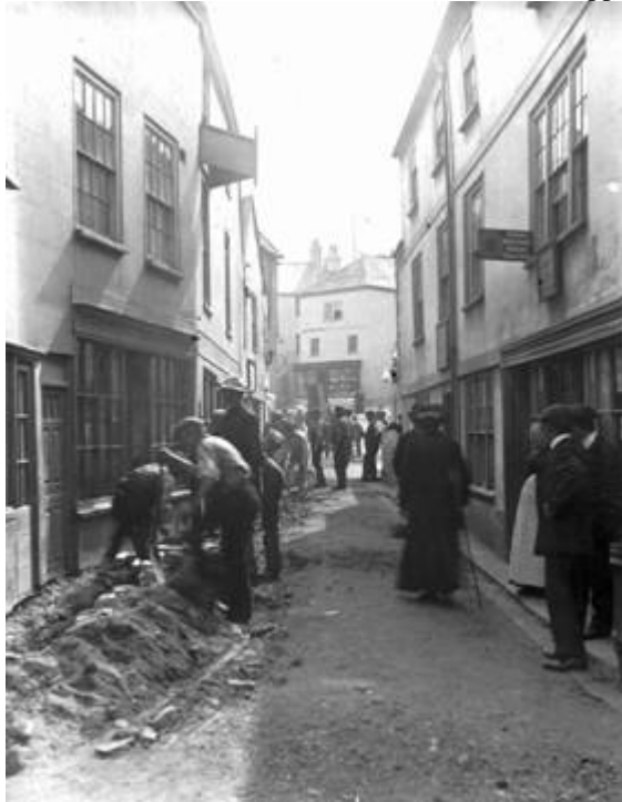
Laying the First Cables in June 1909

One hundred years ago, on June 1 st 1909, Lyme Regis became the first town in Dorset with a public electricity supply: not quite the cutting edge of England's electrification, but better than neighbouring Bridport, which waited until December 1929 for its first supply.