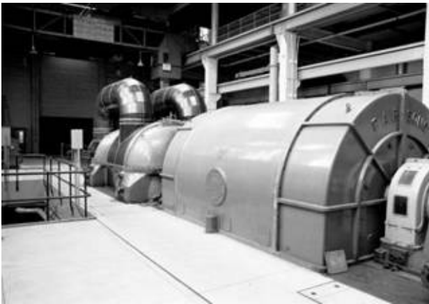
East Yelland Steam Turbine