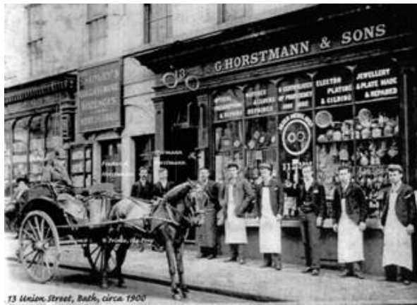
Fig.2 Horstmann's Shop in Bath 1900