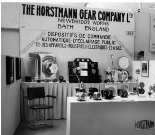
Fig.4 Horstmann's Display at Brussels Fair 1951

A period of major expansion and the start of Horstmann's electric and gas fired central heating controls. Automatic ignition was applied to cookers. A cooker timer was introduced. The first 'off-peak' electricity tariffs were introduced, creating a huge potential for reliable time switches. Several products for vets were introduced but this product range was sold off later