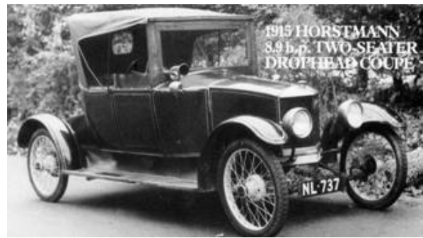
Fig.3 Horstmann's Two Seater Coupe 1915

The post war slump caused diversification into new products such as gardening tools, domestic clocks, mousetraps and cages for transporting and mailing queen bees. The main markets continued in street lighting controls, gas ignition, time switches and gauges. G Horstmann & Son's retail business in Union Street closed in 1925 ending 41 years on the premises and 73 years as watchmakers, jewellers and retailers.