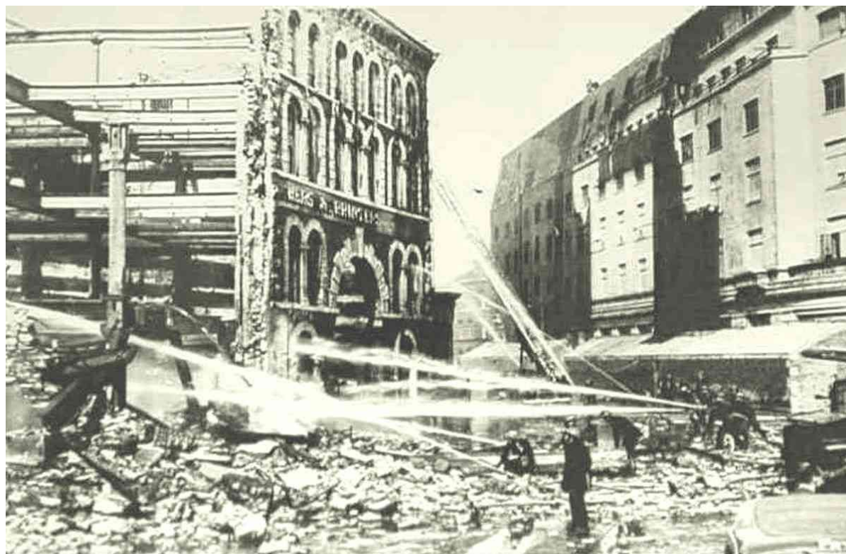
Electricity House in camouflage - Near miss - 1940

Note inserted in the text a photo entitled Electricity House swathed in camouflage:-