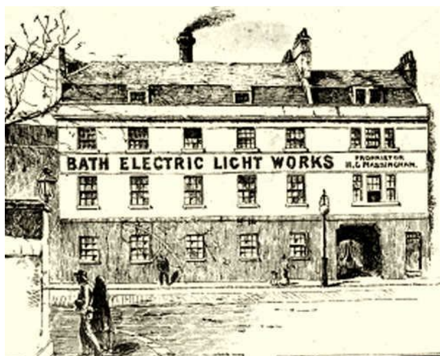
Fig. 2 Mr. Massingham's Electric Light Works in Dorchester Street

"Motive Power and Engineering Plant. - Four 105 H.P. Babcock and Wilcox Boilers duly erected and put to work. Four 6 1/2inch and 12 1/2inch by 8-inch Vertical Brush Compound Engines, each with an acme governor, flywheel and continuous lubricating arrangement, and three 12-inch and 20-inch by 14-inch Brush Vertical Compound Engines each with an acme governor, stop valve, sight feed, and continuous lubricating arrangement, hand expansion gear and flywheel with eight grooves for driving direct. One Brass Tube Surface Condenser with a surface stated to have 1,000 superficial feet, with a 7-inch by 10-inch and a 10-inch by 12-inch duplex air and circulating pump, said to be capable of delivering 20,000 gallons of water per hour. This was installed in March 1890, and has been at work giving a vacuum of about 20 to 22 inches. It is provided with a serviceable mercury vacuum gauge. One Steam Boiler feed pump said to be capable of delivering 1,000 gallons per hour, also one Worthington duplex feed pump; either of these pumps is equal to the duty of feeding two boilers. Two feed tanks to contain 490 gallons carried on iron girders. One steam trap. The necessary steam, circulating and exhaust pipes and valves for the Engines that are fixed. One overhead travelling crane with rails.