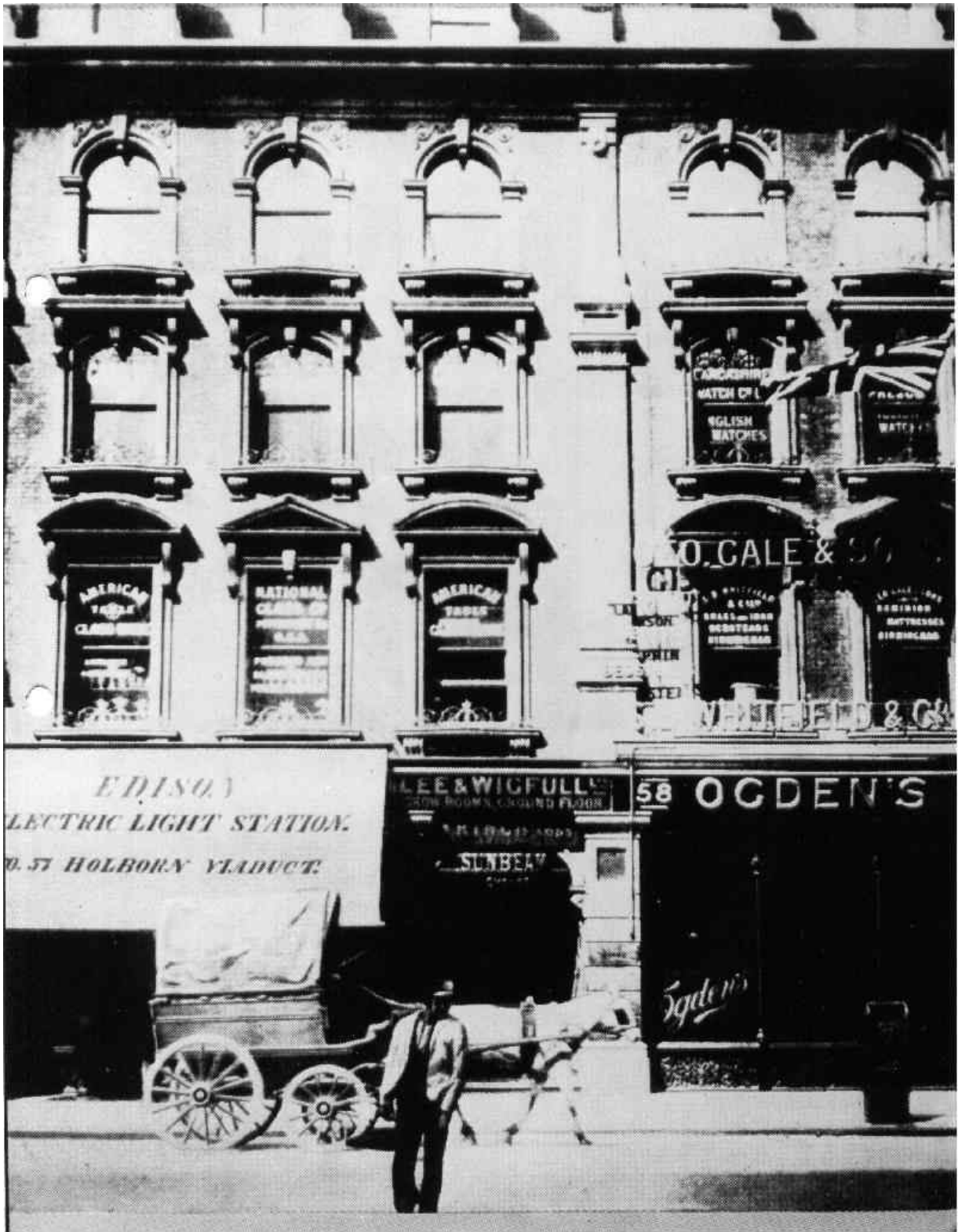
Fig. 1 "Edison Electric Light Station 57 Holborn Viaduct" (words written on the awning)