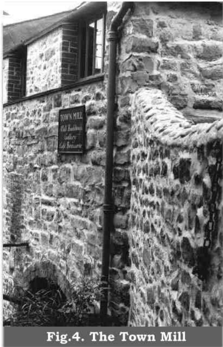
Fig.4. The Town Mill