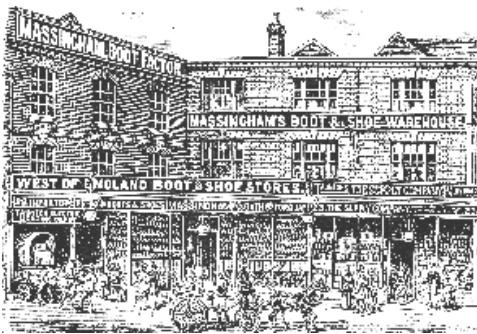
Fig.1 Massingham's original premises 22/23 Fore Street within which he established the first generating station in the South West.

Electric lighting was first displayed in Taunton at the dedication of the Masonic Hall in The Crescent in 1879 using Serrin arc lamps powered by batteries. In the same year Taunton played Wellington at rugby near Wellington railway station lit with four Siemen's arc lights supplied by a generator. A return match was staged at Vivary Park but only three of the four lights functioned. By 1882 the iron foundry of Easton & Waldergrave and the exterior of a Somerset County Herald newspaper office were both illuminated by the locally made "Newton" arc light. Newton's company closed in 1934 and their factory has only recently been demolished and replaced with housing.