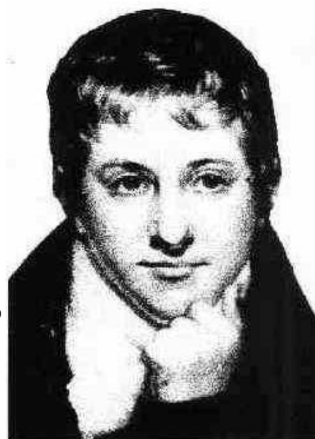
Sir Humphry Davy

www.britannica.com/bcom/eb/article www.cornwall-online.co.uk/cw/davy www.iee.org.uk/Archives/Arclamps www.library/upenn.edu/etext/smith/d/davy2 www.ri.ac.uk/History/H.Davy www.treasure-troves.com/bios/Davy