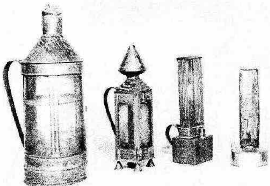
Early Miners Davy Lamps

Some of Davy's own experimental models of the Miners' Safety Lamp