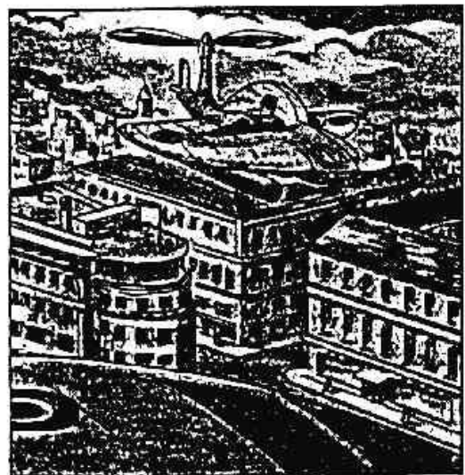
The Generating Section Head's 2-seater "Flea."