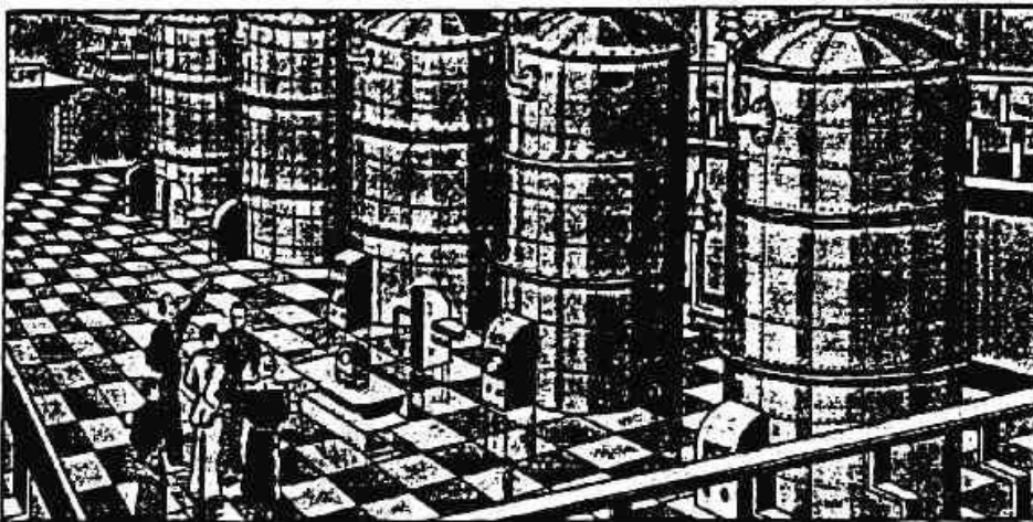
Large cylinders, throbbing with energy, line the walls of the 1998 power station.

As one of the most junior of the party I was in the third group, and spent the next ten minutes (there being a five-minute gap between the start of each group's tour) looking at the photographs and diagrams which lined the otherwise friendly reception-room. One most interesting exhibit was a diagram showing the load growth of our Board since its inception in 1948, and it came as something of a shock to me to realise that when the Board started there was only a little over 300 MW of load. whereas now, a mere 50 years later, the Board's load exceeds 2,000 MW.